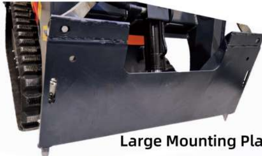
Large Mounting Plate