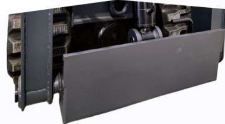
CII Universal Mounting Plate